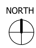
1 LEVEL 1 - FINISH PLAN 1/8" = 1'-0"

\\SLIBERVEN\Share\Prosperity Bank - Steering Plaza 6th & 7th\Drawings\Design Development\Prosperity Bank - Steering Plaza_Central model.rvt