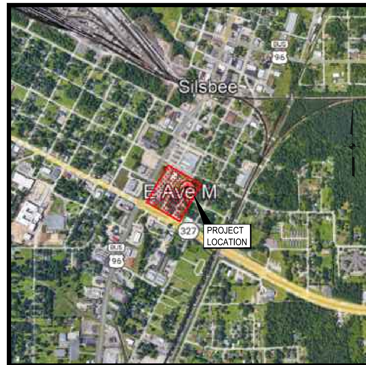
LOCATION MAP SCALE: N.T.S.