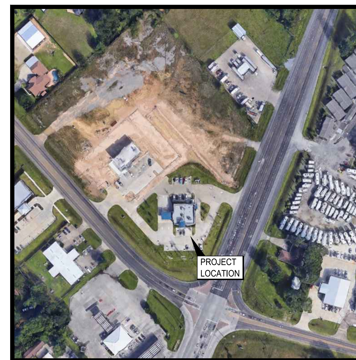
VICINITY MAP SCALE: N.T.S.